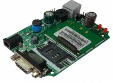
Fig. 7: GSM Module

Global System for Mobile communication (GSM) is an architecture used for mobile communication. Fig. 7 shows GSM Module.