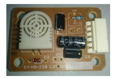
Fig. 10: SY-HS-220 (Humidity)

The PCB consists of CMOS timers to pulse the sensor to provide output voltage. Fig.10 shows SY-HS-220 sensor for Humidity.